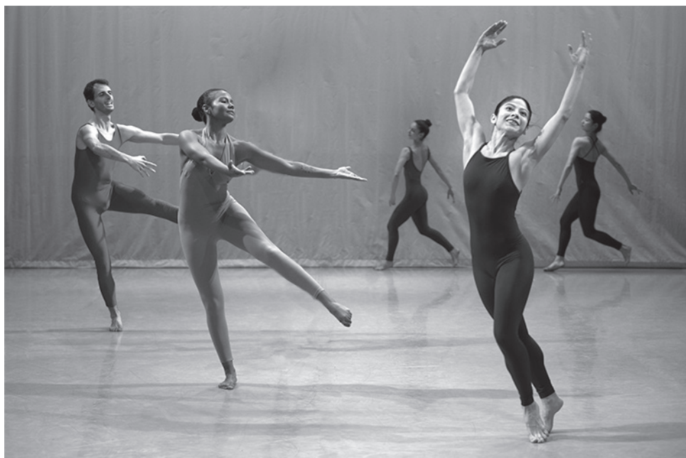
Graham School dancers in Diversion of Angels

December 9, 2023 Martha Graham Studio Theater